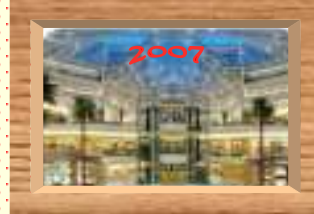
The Somerset Collection, Troy