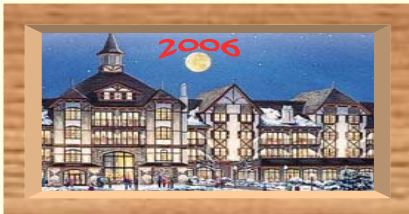
Grand Lodge, Boyne Mountain