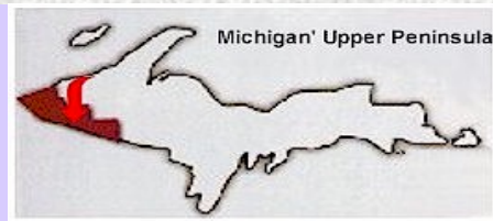
Michigan' Upper Peninsula