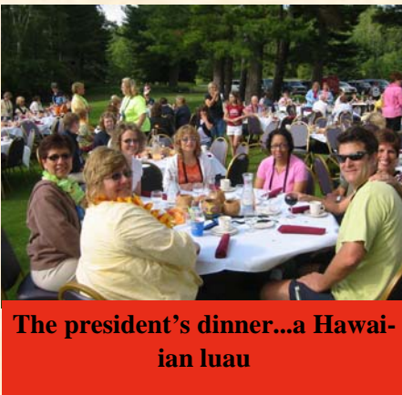
The president's dinner...a Hawaiian luau