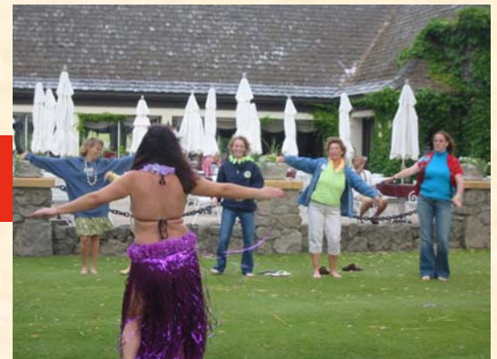
Learning the Hula